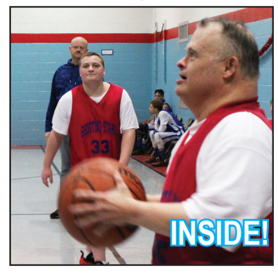
Special Olympics photo spread! PAGE 6